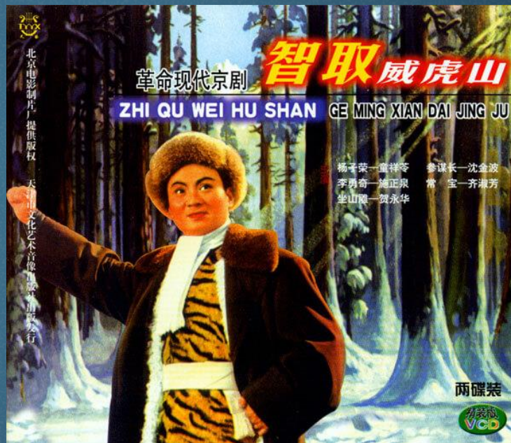
Promotional Poster for the Chinese film "Taking Tiger Mountain by Strategy"

The CCP's literature committees dictated what was allowed to be preformed and broadcasted. For about a decade, the only entertainment aired on Chinese TV was limited to eight revolutionary operas, three war movies and some song renditions.